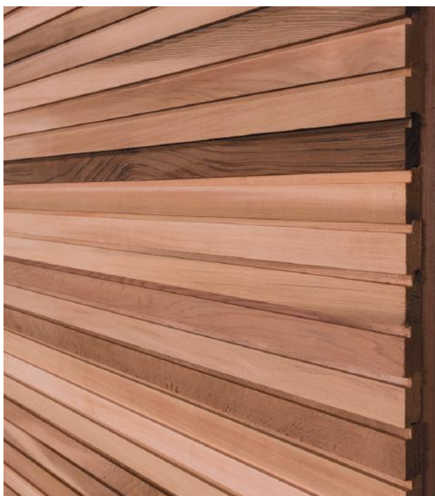
Cequence Privacy Slim Fence Panels – 180cm Wide