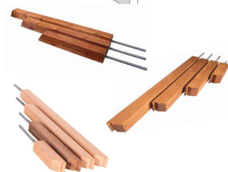
Cedar Top of Wall Posts 90mm x 70mm with 20mm Galvanized Stud bar