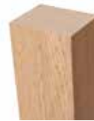
Cedar Flat Top Post