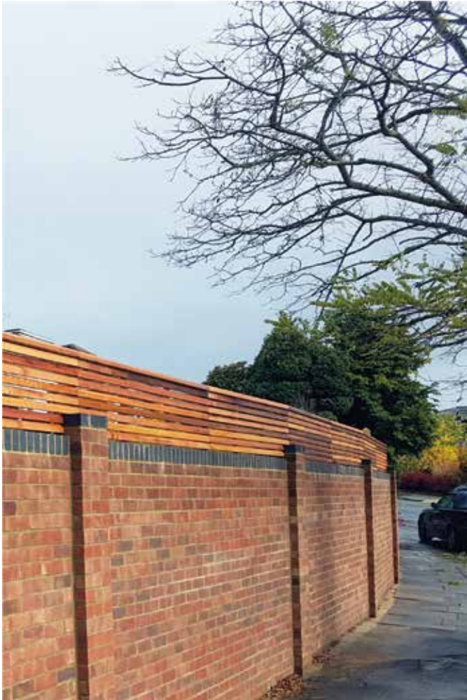
Pictured: Cedar top of wall fencing