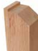
Cedar Profiled Top Post