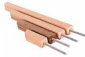
Cedar Profiled Top Of Wall Posts

The end product is a neat fence post fixed to the top of your wall with no visible fixings. Cequence top of wall posts are suitable for fixing fencing up to 120cm high. If you want your fencing higher we suggest using our heavy duty post brackets.