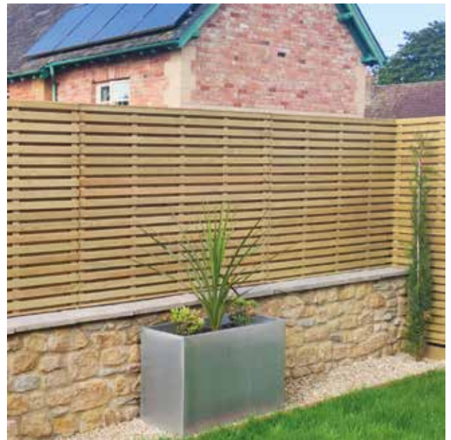
Pictured: Double Sided Venetian Tanalised Redwood Fencing

The Redwood battens are planed on all four sides and have eased corners.